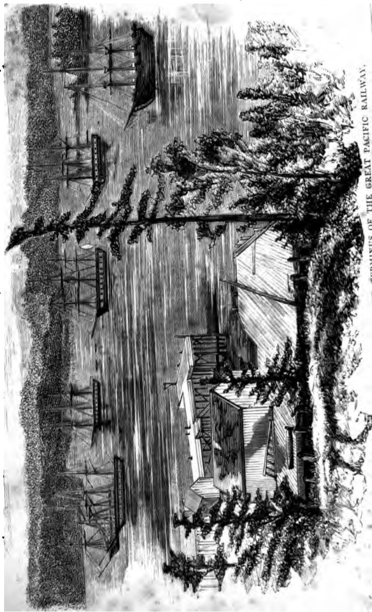
ESQUIMAUZ HARBOUR, VICTORIA, THE PROPOSED TERMINUS OF THE GREAT PACIFIC RAILWAY.